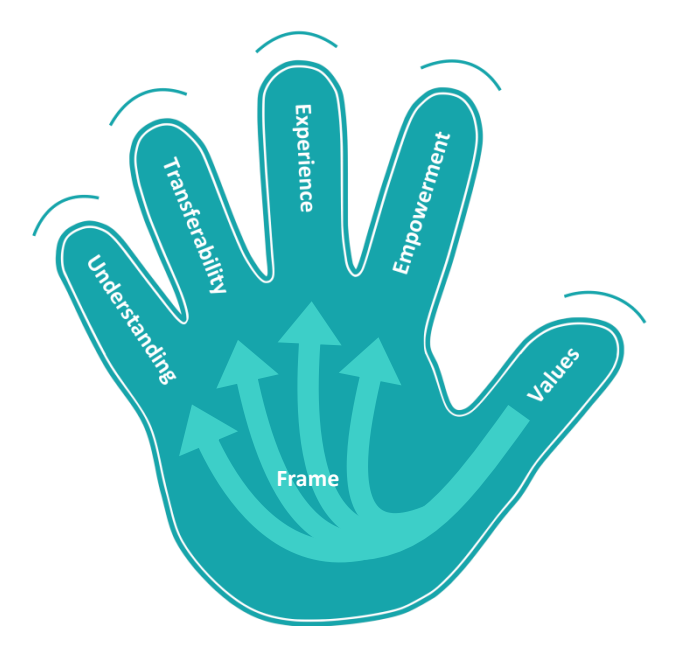
Figure 2 Frames are rooted in values and connect understanding, transferability, experience, and empowerment